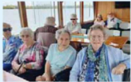
All aboard: Local Mareeba Aged Care residents aboard the Clarence River Ferry last week for a history tour of the local region.

provided for residents aboard the ferry including the history of the Clarence River and Maclean. Mareeba Aged Care, located in Maclean regu-