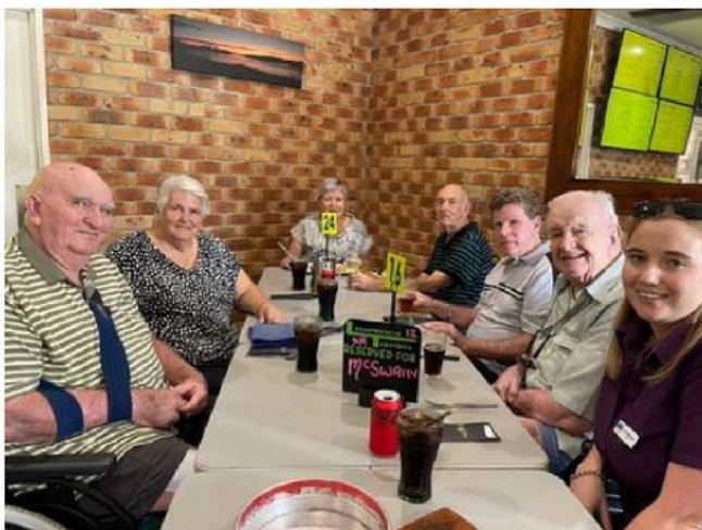
Men's outing to Lawrence Pub