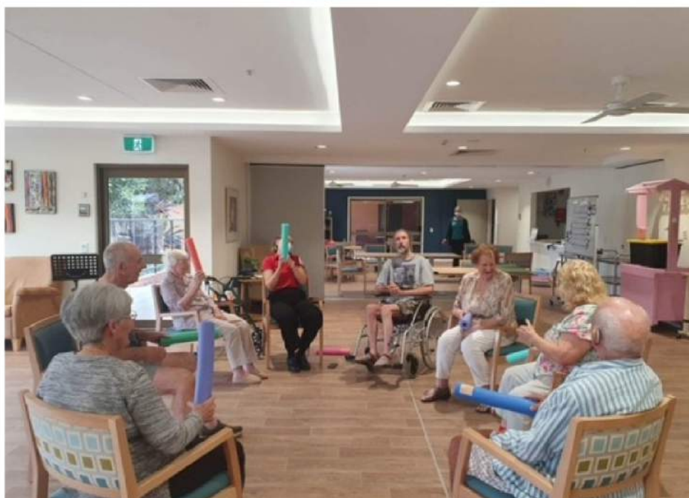
Fun with our Occupational Therapy students