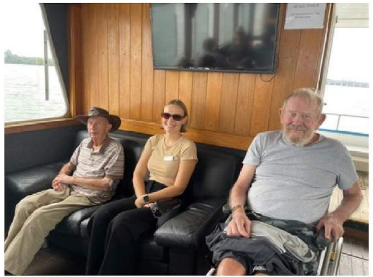
2nd Ferry Cruise on the Clarence River